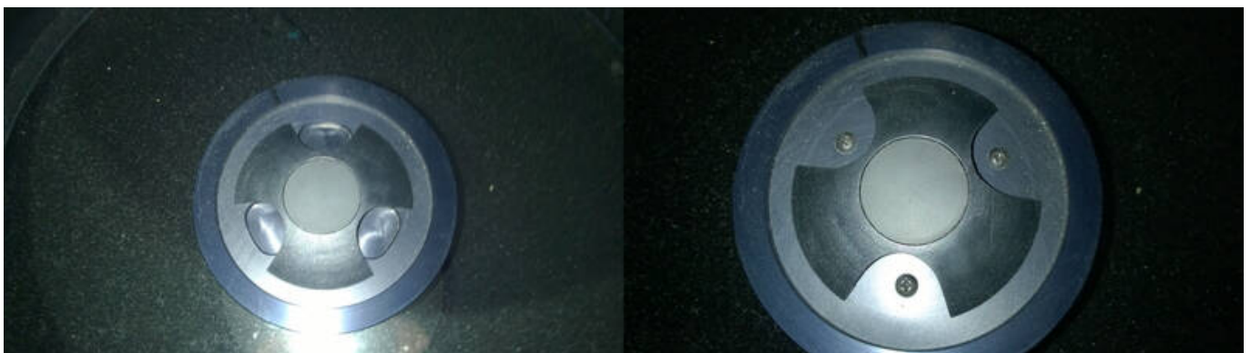
Secondary mirror (right panel: the cover is rotated, so that the screws are visible)

ATTENTION: ONLY VERY MARGINAL CORRECTIONS NEED TO BE APPLIED TO THE SCREWS!