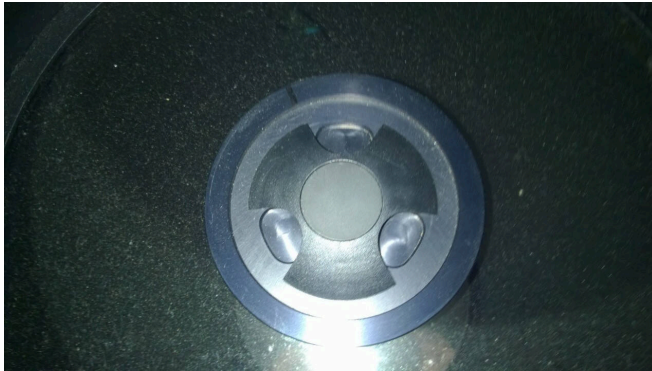
Dirty Schmidt plate