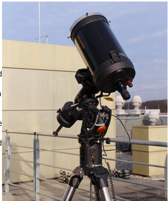
CGE PRO mit C11

To protect the sensitive electronics from humidity and other harsh weather conditions they are stored in the lab course room.