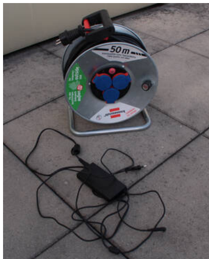
Fig. 10: Mobile power supply and the cable reel