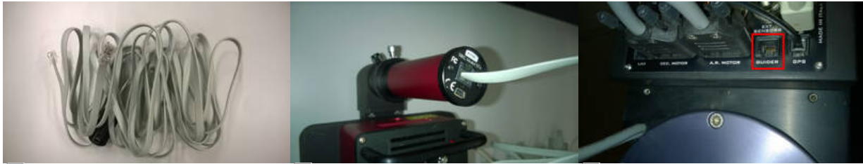
4: Guider cable for the ST-i