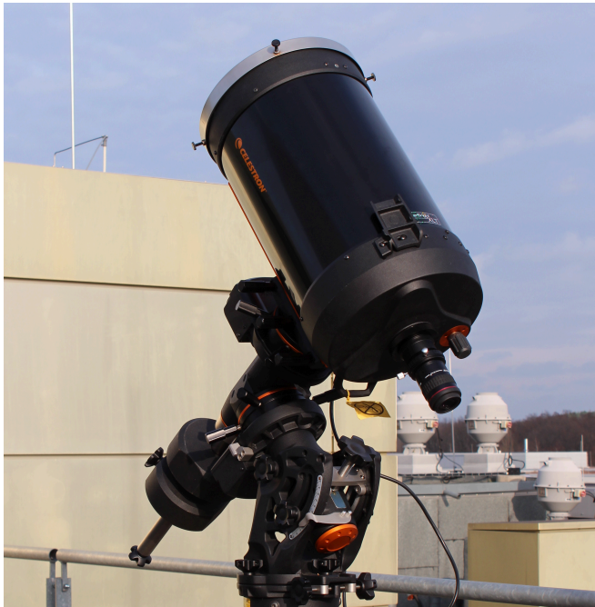
The C11 on the CGE Pro