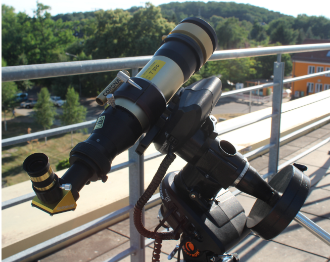
Das Solar Max II auf der Advanced GT