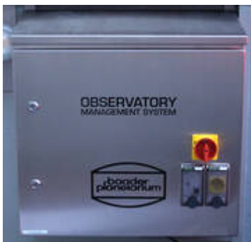
Observatory Management System (OMS)