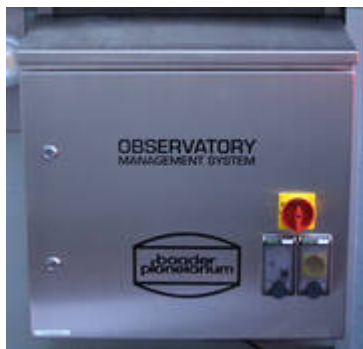
Observatory Management System (OMS)