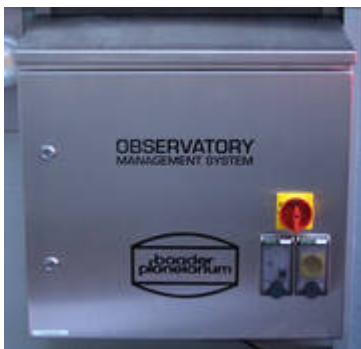
Observatory Management System (OMS)