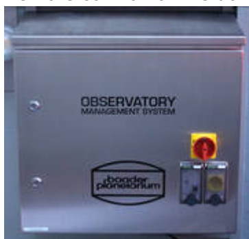
Observatory Management System (OMS)