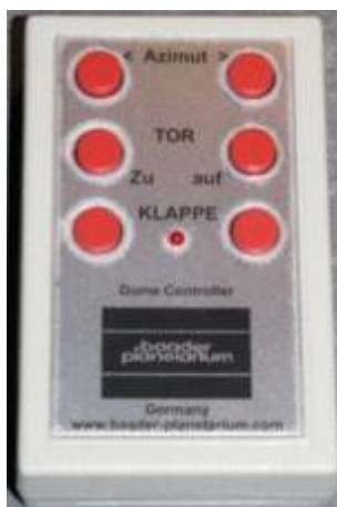
Remote control for the dome

The dome has an emergency closing function that automatically closes the dome in case of a power failure. This function is provided by the blue box to the right of the dome control box (number 4 in the sketch). This box has a power switch, if accidentally operated the dome will close automatically and will not respond to any further commands until the switch is operated again. Directly underneath in the black box is the battery, which supplies the power needed for the emergency closure.