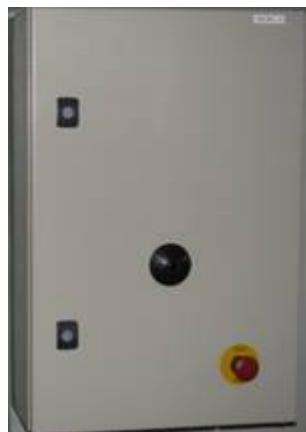
Control box with the emergency button