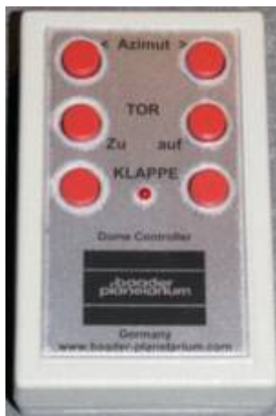
Remote control for the dome

The dome has an emergency closing function that automatically closes the dome in case of a power failure. This function is provided by the blue box to the right of the dome control box (number 4 in the sketch). This box has a power switch, if accidentally operated the dome will close automatically and will not respond to any further commands until the switch is operated again. Directly underneath in the black box is the battery, which supplies the power needed for the emergency closure.