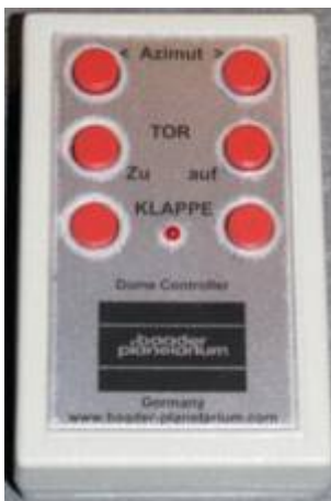
Remote control for the dome

The dome has an emergency closing function that automatically closes the dome in case of a power failure. This function is provided by the box to the right of the dome control box (number 4 in the sketch). This box has a power switch, if accidentally operated the dome will close automatically and will not respond to any further commands until the switch is operated again. Directly underneath in the black box is the battery, which supplies the power needed for the emergency closure.