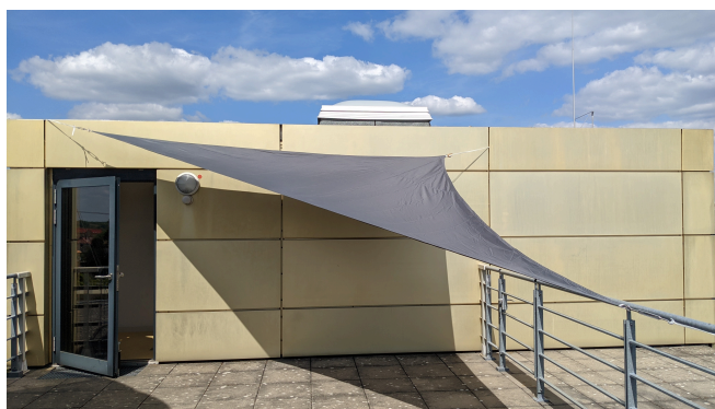
Awning in use

. We also have a triangular awning for the roof. One of the shorter sides is stretched parallel to the stairs and the other parallel to the railing. To do this, the left eyelet of the awning is hooked into the strap already attached to the roof access above the door using a turnbuckle. The right eyelet is hooked into the strap above the railing using a carabiner. The third eyelet is again attached to the strap on the guardrail with a turnbuckle. The sail is tensioned using the turnbuckles.