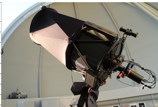
OST 2.0: The CDK20 from Planewave with the QHY600M and Sti