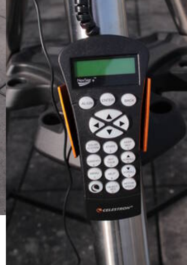
Fig. 11: Hand terminal