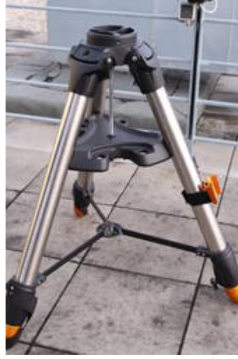
Fig. 1: CGE PRO tripod