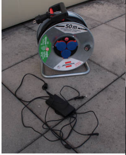
Fig. 10: Mobile power supply and the cable reel