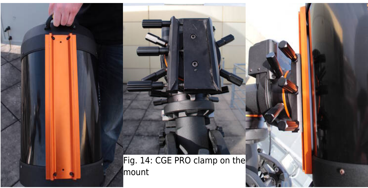
Fig. 13: Dove tail on the tube

Last update: 2024/02/20 en:ost:telescope:c11_bedienung https://polaris.astro.physik.uni-potsdam.de/wiki/doku.php?id=en:ost:telescope:c11_bedienung&rev=1708417452 08:24