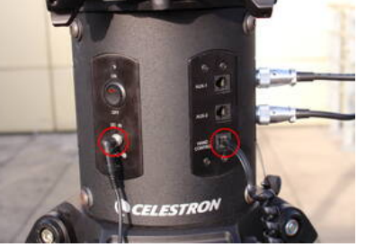
Fig. 12: Ports for the power supply (left) and the hand terminal (right) at the electronic box