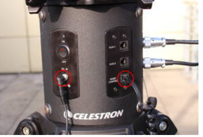
Abb. 12: Ports for the power supply (left) and the hand terminal (right) at the electronic box