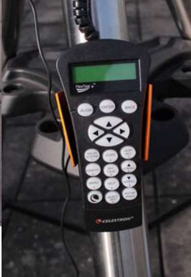
Abb. 11: Hand terminal