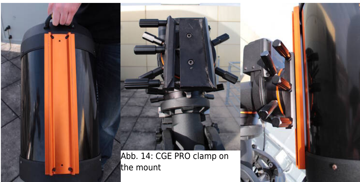
Abb. 13: Dove tail on the tube

Last update: 2021/06/08 en:ost:telescope:c11_bedienung https://polaris.astro.physik.uni-potsdam.de/wiki/doku.php?id=en:ost:telescope:c11_bedienung&rev=1623155202 12:26