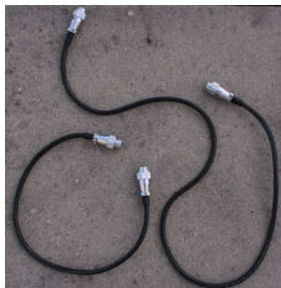
Abb. 7: Cables for the connection of the electronic box with the engines