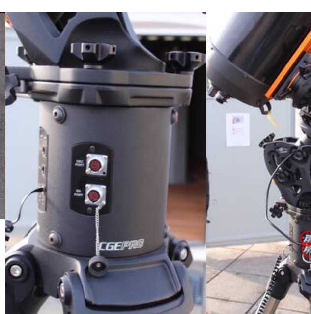
Abb. 8: Electronic box with ports for the cables