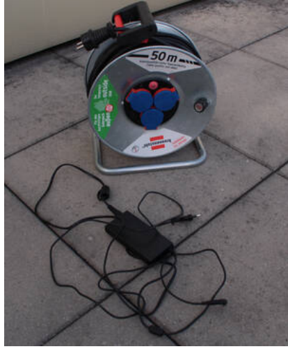
Abb. 10: Mobile power supply and the cable reel