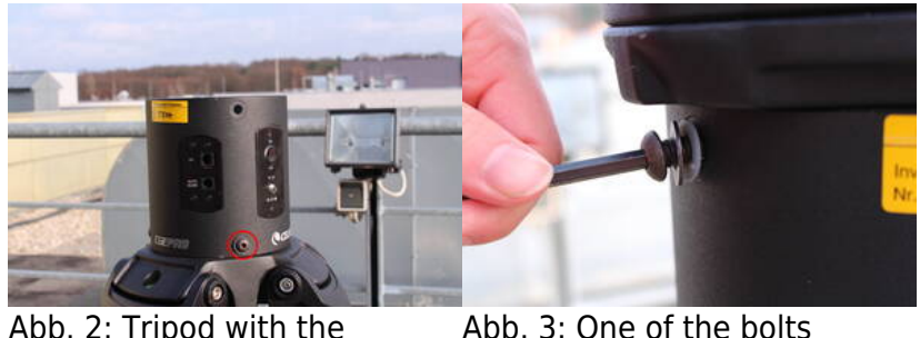
Abb. 2: Tripod with the Abb electronic box (the red circle indicates one of the bolts that needs to be fastened)