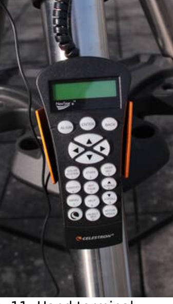
Fig. 11: Hand terminal