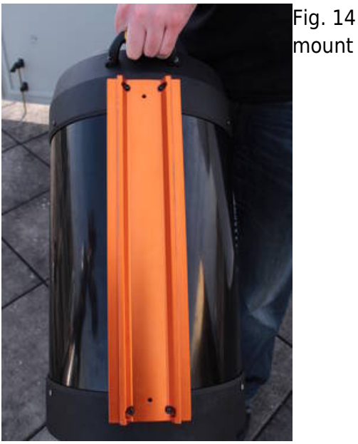
Fig. 13: Dove tail on the tube

Last update: 2017/10/21 en:ost:telescope:c11_bedienung https://polaris.astro.physik.uni-potsdam.de/wiki/doku.php?id=en:ost:telescope:c11_bedienung&rev=1508623428 22:03