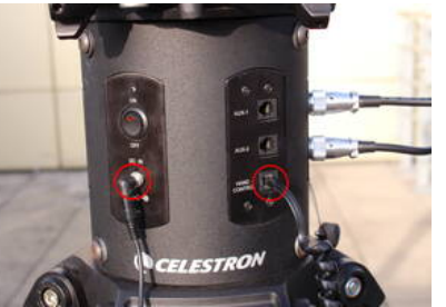
Fig. 12: Ports for the power supply (left) and the hand terminal (right) at the electronic box