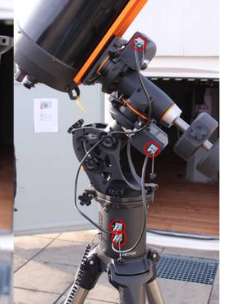
Fig. 9: CGE PRO with the cable attached