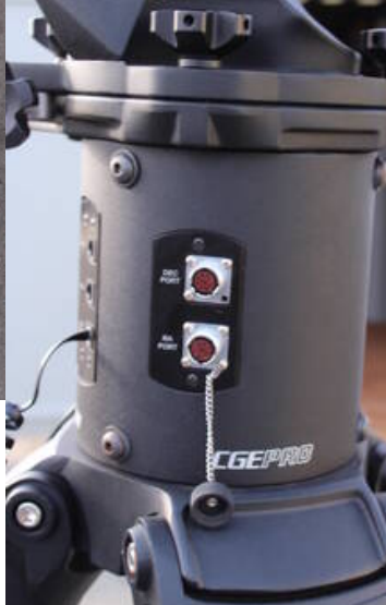
Fig. 8: Electronic box with ports for the cables