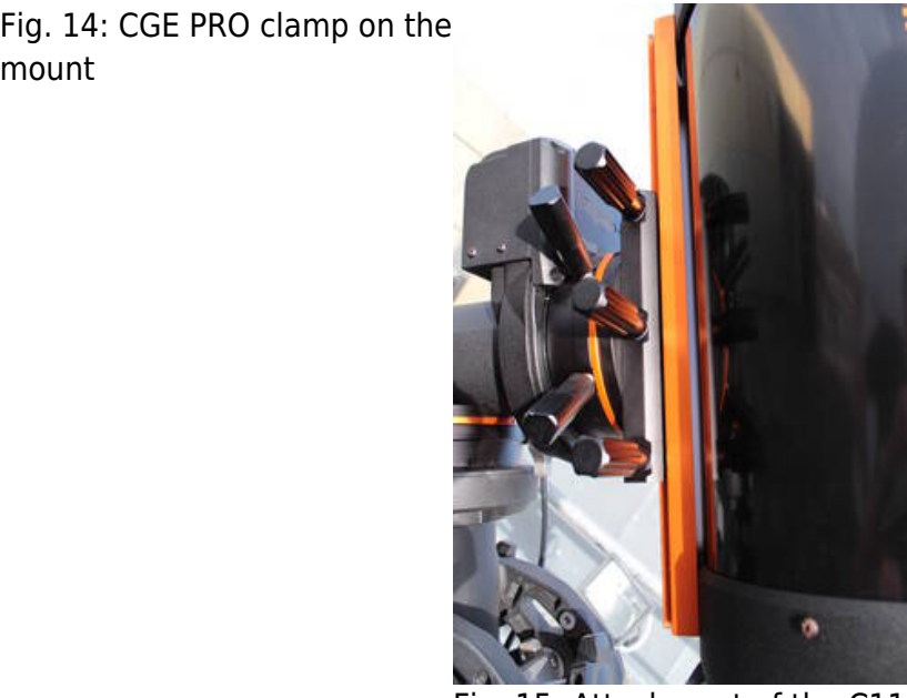
Fig. 15: Attachment of the C11 at the CGE PRO