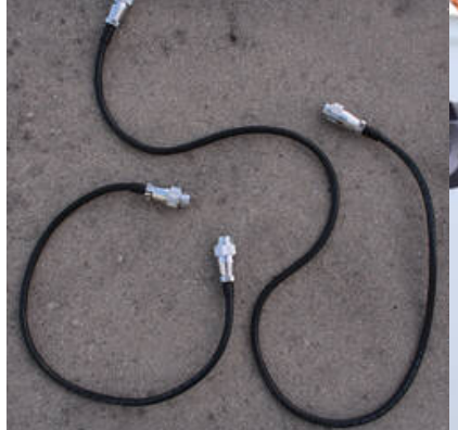
Fig. 7: Cables for the connection of the electronic box with the engines