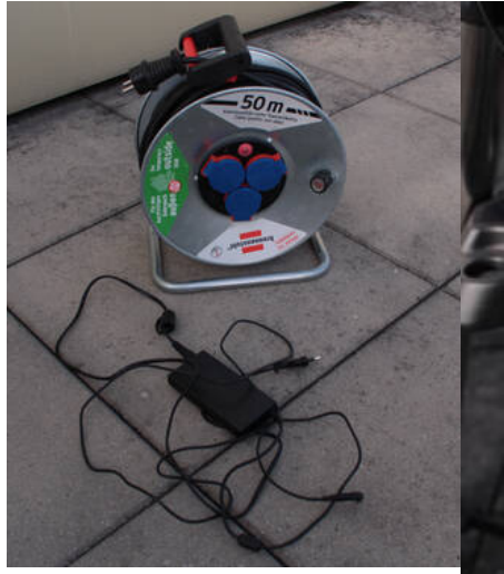
Fig. 10: Mobile power supply and the cable reel