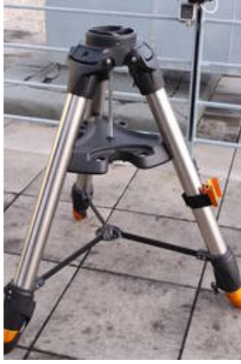
Fig. 2: Tripod with the electronic box (the red circle indicates one of the bolts that needs to be fastened)