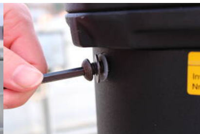
Abb. 3: One of the bolts