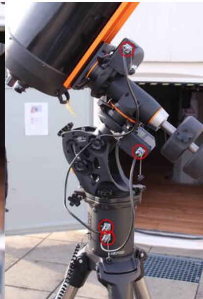
Fig. 9: CGE PRO with the cable attached