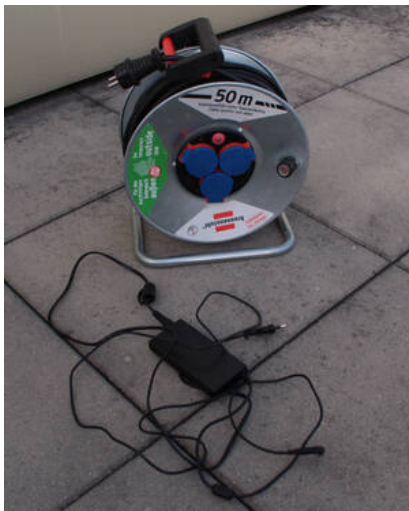
Fig. 10: Mobile power supply and the cable reel