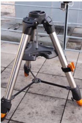
Fig. 1: CGE PRO tripod