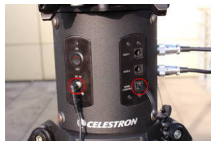
Fig. 12: Ports for the power supply (left) and the hand terminal (right) at the electronic box