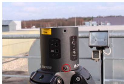
Fig. 2: Tripod with the electronic box (the red circle indicates one of the bolts that needs to be fastened)