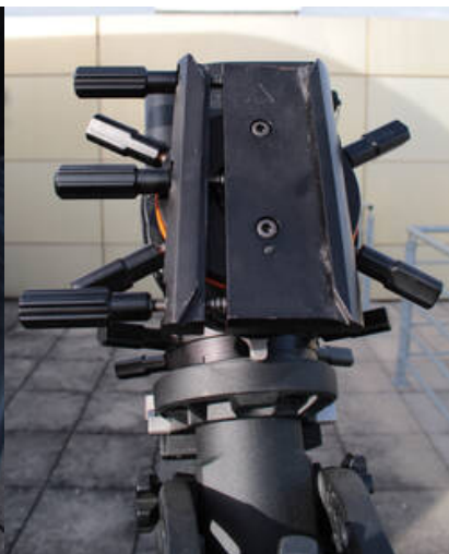
Fig. 14: CGE PRO clamp on the mount