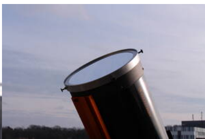
Fig. 17: Tube with the sun filter