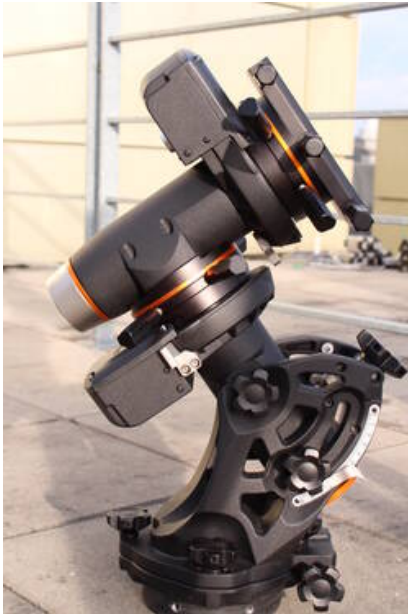
Fig. 4: Mechanics of the CGE PRO