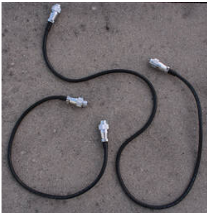
Fig. 7: Cables for the connection of the electronic box with the engines