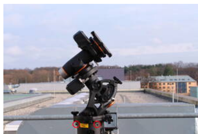
Fig. 5: CGE PRO mounted on the electronic box and the tripod (the red circles indicate two of the bolts that need to be fastened)