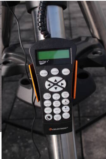
Fig. 11: Hand terminal