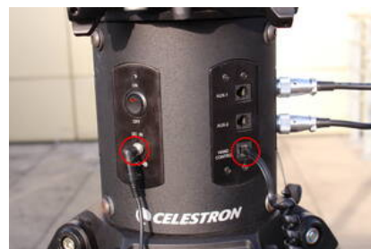
Fig. 12: Ports for the power supply (left) and the hand terminal (right) at the electronic box