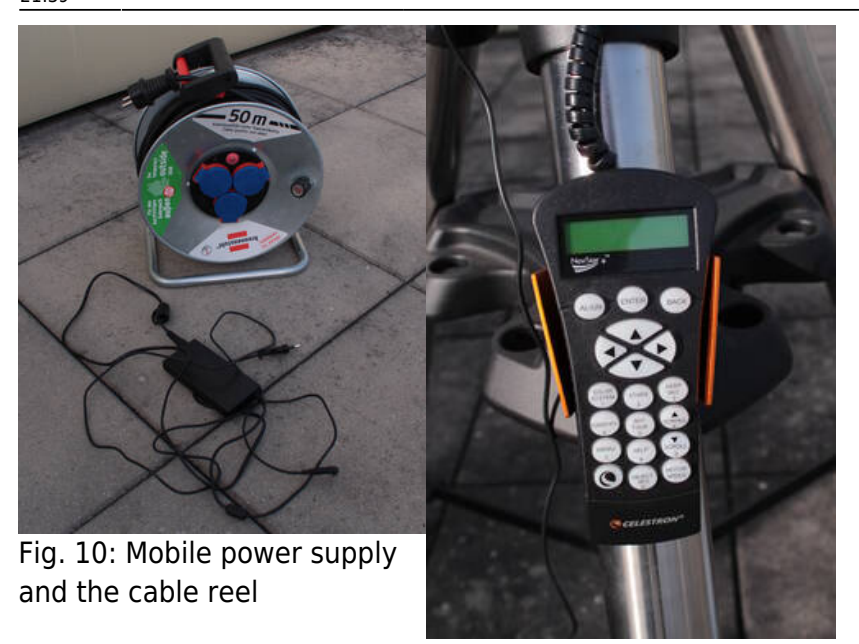
Fig. 11: Hand terminal