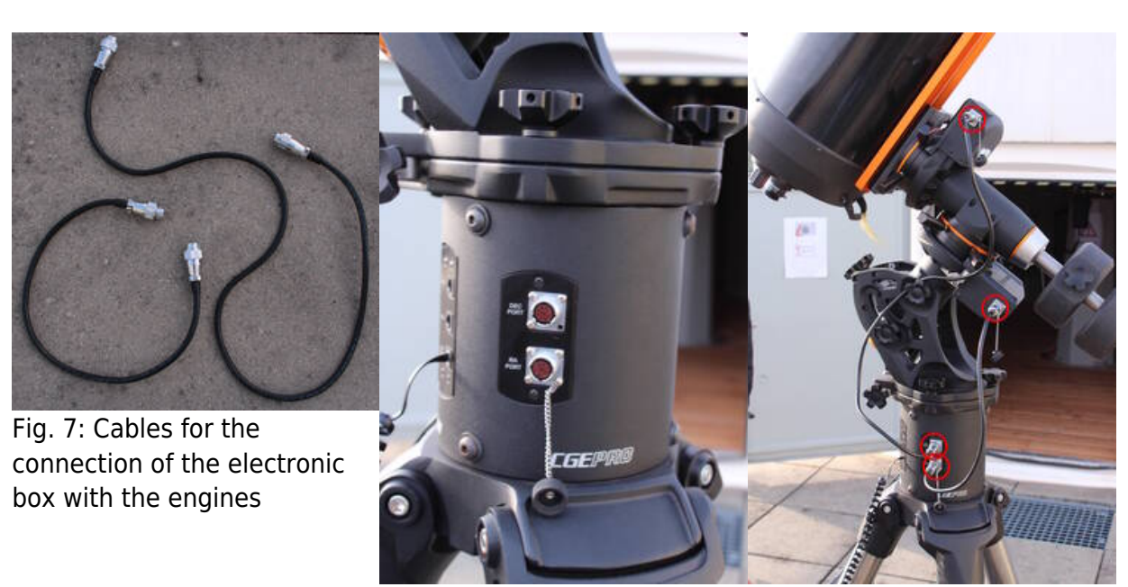
Fig. 8: Electronic box with ports for the cables