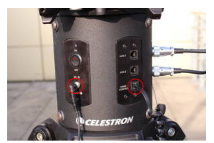
Fig. 12: Ports for the power supply (left) and the hand terminal (right) at the electronic box