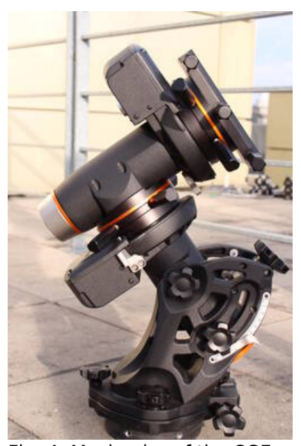
Fig. 4: Mechanics of the CGE PRO