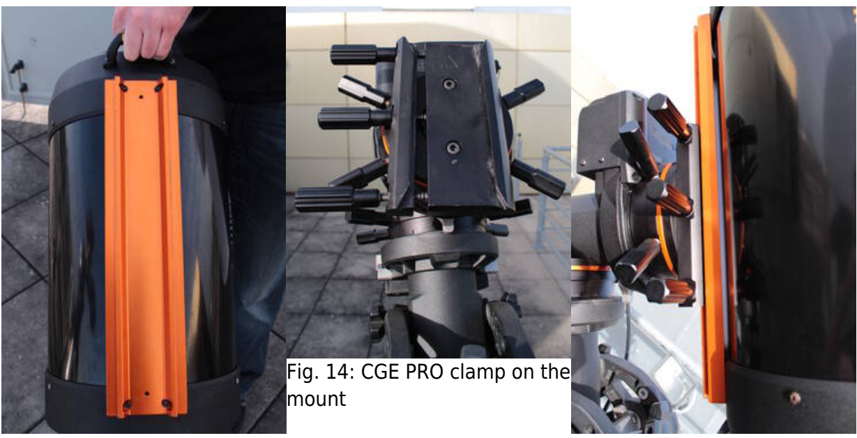
Fig. 13: Dove tail on the tube