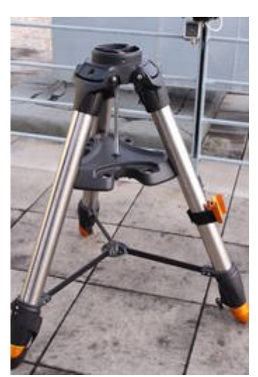
Fig. 1: CGE PRO tripod