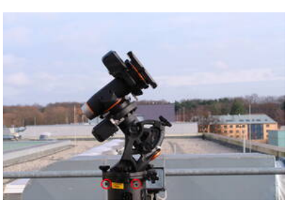
Fig. 5: CGE PRO mounted on the electronic box and the tripod (the red circles indicate two of the bolts that need to be fastened)