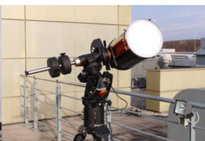
Fig. 18: completely build up telescope