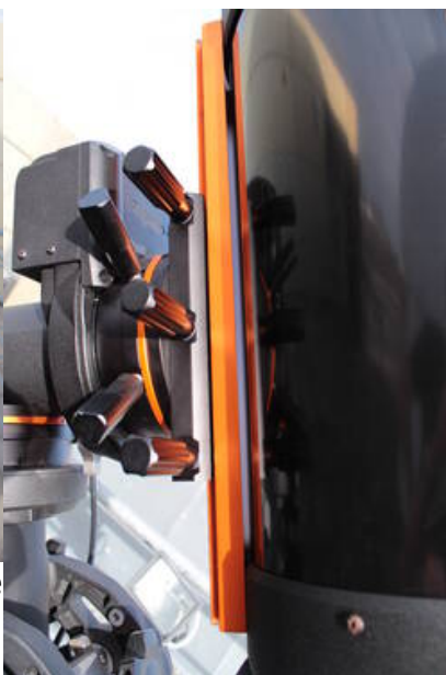
Fig. 15: attachment of the C11 at the CGE PRO