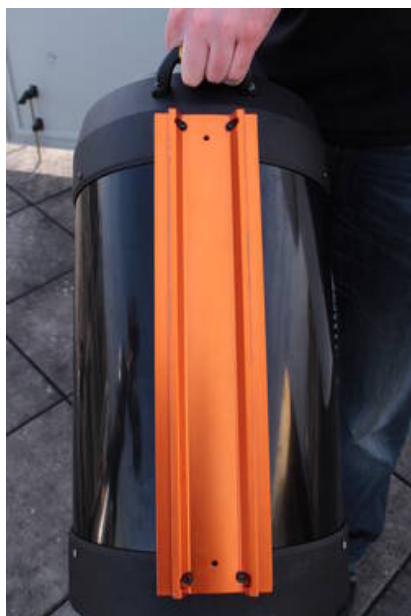
Fig. 13: dove tail on the tube