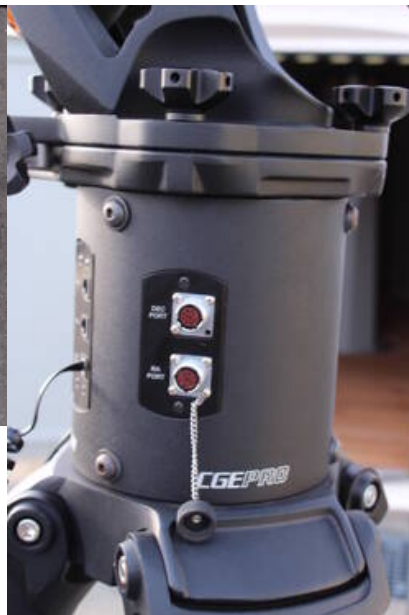
Fig. 8: electronic box with ports for the cable to the engines