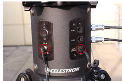
Fig. 12: ports for power supply (left) and terminal (right) at the electronic box