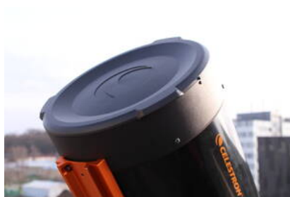
Fig. 16: tueb with cover