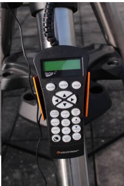
Fig. 11: terminal