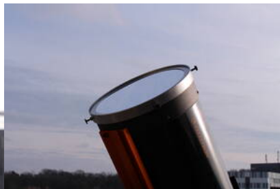
Fig. 17: Tube with the sun filter