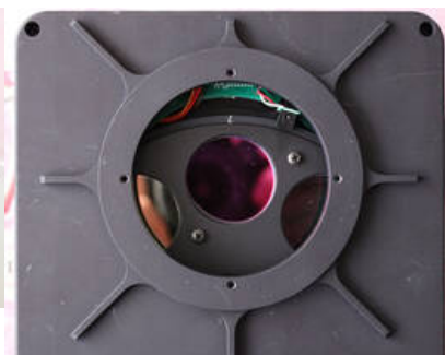
5. Filter wheel with the cover