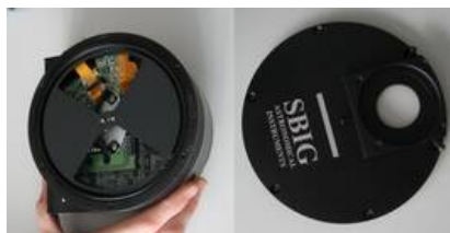
1: ST8 and cover