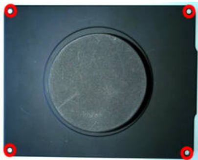
1. Cover of the STF-8300

2. Backplate of the filter wheel mounted to the STF-8300 (the red circles mark the corresponding screws, the blue circle marks the sensor for the filter wheel position)