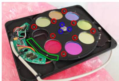
4. Filter wheel with inserted filter holder (the red circles mark the screws that attach the cover to the filter holder, the blue circles mark the screws that attach the filter holder to the backplate of the filter wheel)