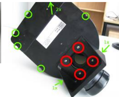
3: Screw positions on the filter-wheel backplate (green circles) and the AO case (red circles)