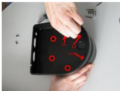
2: ST-8 with the attached filter-wheel case