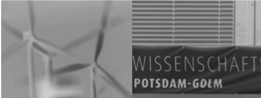
Wind turbines near Golm