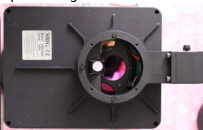
6. Filter wheel with the OAG