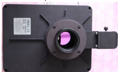
7. Filter wheel with the OAG and T2 adapter