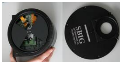
1: ST8 and cover