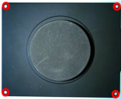
1. Cover of the STF-8300