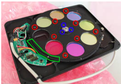
4. Filter wheel with inserted filter holder (the red circles mark the screws that attach the cover to the filter holder, the blue circles mark the screws that attach the filter holder to the backplate of the filter wheel)