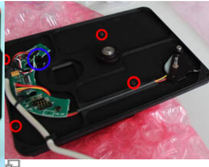
2. Backplate of the filter wheel mounted to the SFT-8300 (the red circles mark the corresponding screws, the blue circle marks the sensor for the filter wheel position)