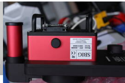
9. STF-8300 with filter wheel, OAG, and ST-i