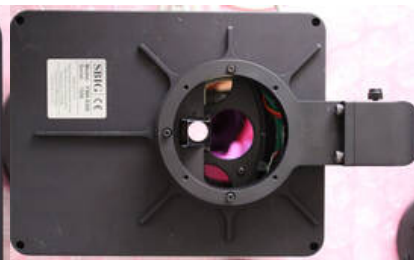
6. Filter wheel with the OAG