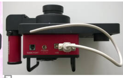
8. Side view of the STF-8300