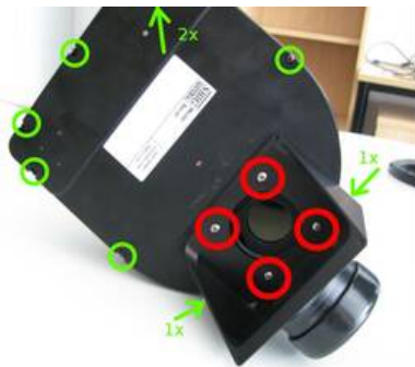
3: Screw positions on the filter-wheel backplate (green circles) and the AO case (red circles)