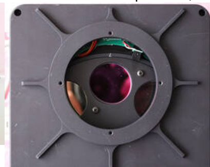
5. Filter wheel with the cover