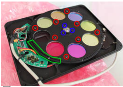
4. Filter wheel with inserted filter holder (the red circles mark the screws that attach the cover to the filter holder, the blue circles mark the screws that attach the filter holder to the backplate of the filter wheel)