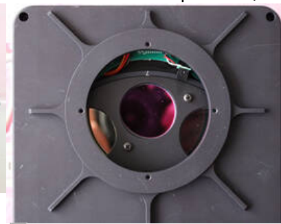
5. Filter wheel with the cover