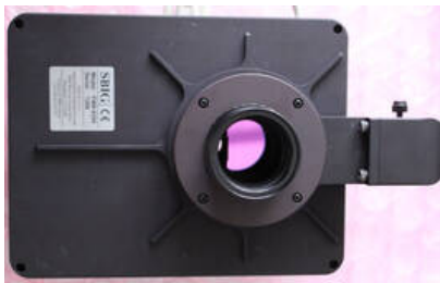
7. Filter wheel with the OAG and T2 adapter