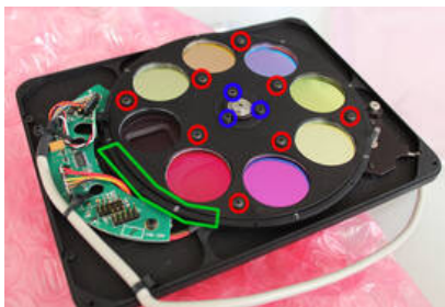
4. Filter wheel with inserted filter holder (the red circles mark the screws that attach the cover to the filter holder, the blue circles mark the screws that attach the filter holder to the backplate of the filter wheel)