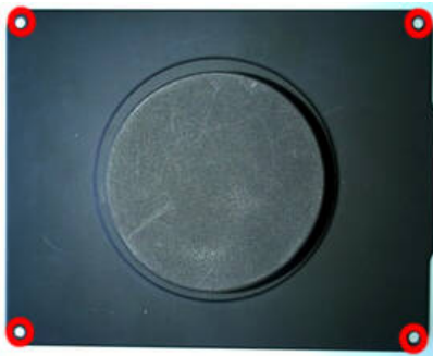
1. Cover of the STF-8300