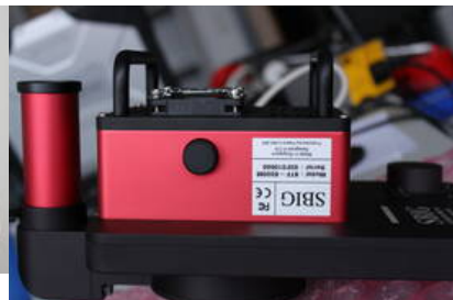
9. STF-8300 with filter wheel, OAG, and ST-i