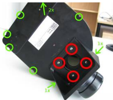
3: Screw positions on the filter-wheel backplate (green circles) and the AO case (red circles)