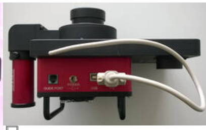
8. Side view of the STF-8300