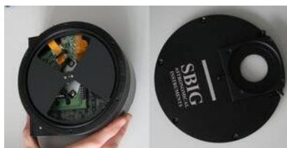
1: ST8 and cover