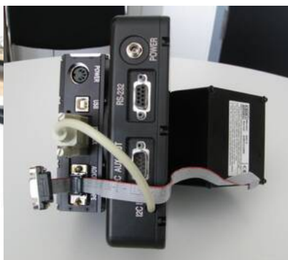
5: ST-8 with the cable connections