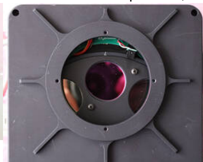
5. Filter wheel with the cover