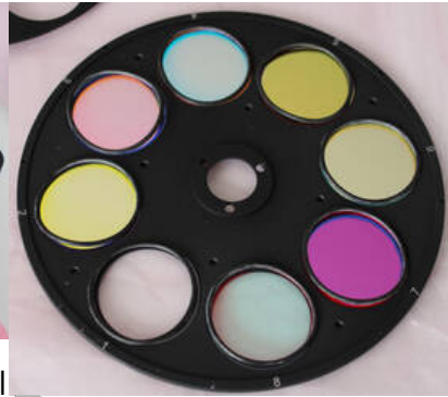
3. Filter holder with filters and spacer rings