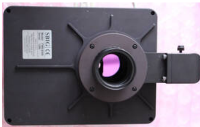
7. Filter wheel with the OAG and T2 adapter