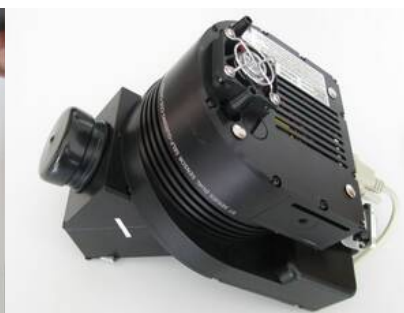
6: Assembled camera