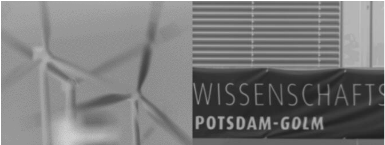
Wind turbines near Golm