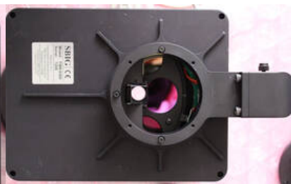
6. Filter wheel with the OAG