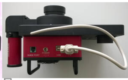
8. Side view of the STF-8300