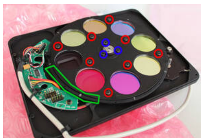
4. Filter wheel with inserted filter holder (the red circles mark the screws that attach the cover to the filter holder, the blue circles mark the screws that attach the filter holder to the backplate of the filter wheel)