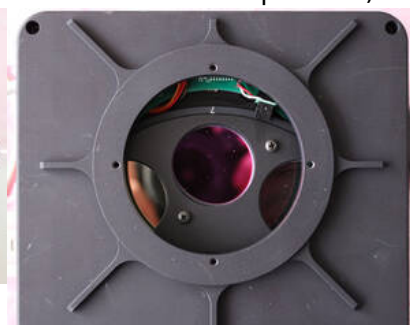
5. Filter wheel with the cover