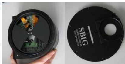
1: ST8 and cover