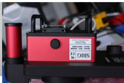
9. STF-8300 with filter wheel, OAG, and ST-i