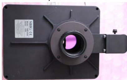
7. Filter wheel with the OAG and T2 adapter