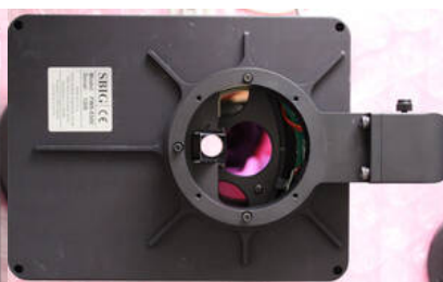
6. Filter wheel with the OAG