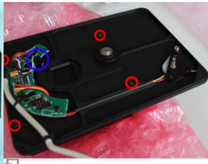
2. Backplate of the filter wheel mounted to the SFT-8300 (the red circles mark the corresponding screws, the blue circle marks the sensor for the filter wheel position)