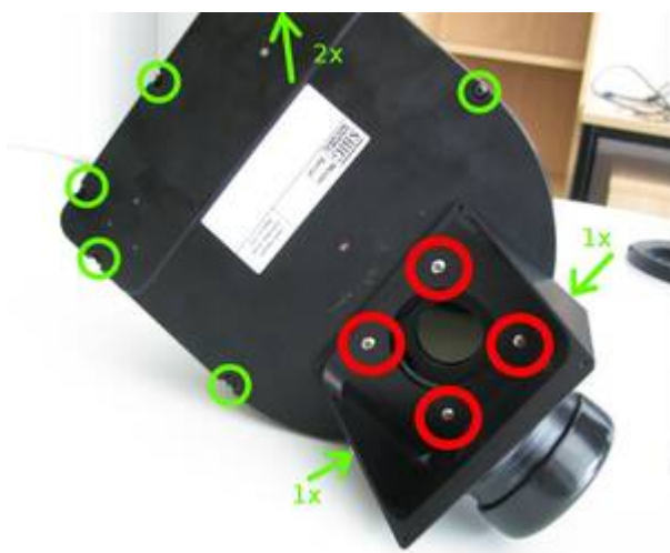
3: Mount the filter wheel