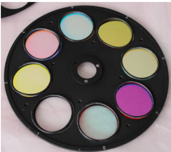
3. Filter holder with filters and spacer rings