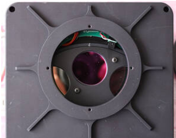
5. Filter wheel with cover