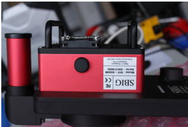
9. STF-8300 with filter wheel, OAG and ST-i