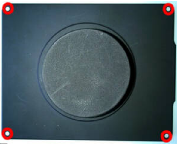
1. Cover of the STF-8300