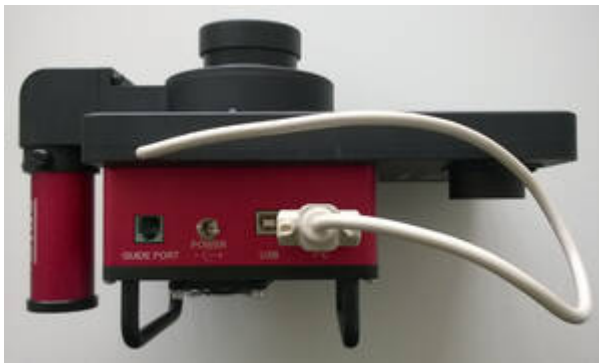
8. Side view of the STF-8300