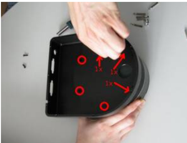
2: Case and filter wheel