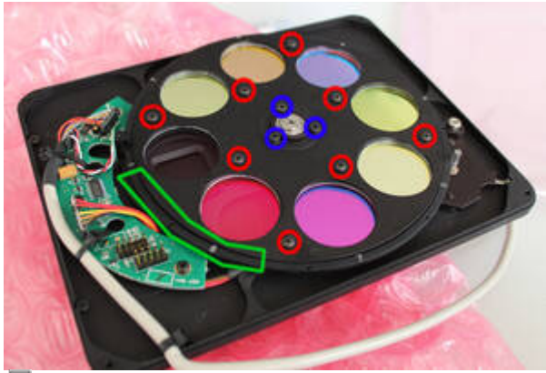
4. Filter wheel with inserted filter holder (the red circles mark the screws that attach the cover to the filter holder, the blue circles mark the screws that attach the filter holder to the backplate of the filter wheel)