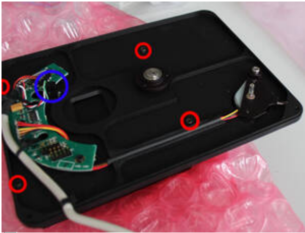
2. Backplate of the filter wheel mounted to the SFT-8300 (the red circles mark the corresponding screws, the blue circle mark the sensor for the filter wheel position)