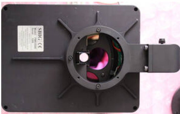
6. Filter wheel with OAG