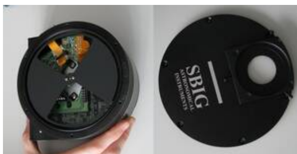
1: ST8 and cover