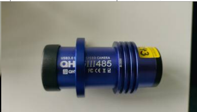
Our QHY 485