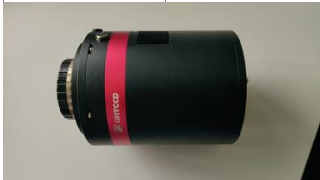
Our QHY 268