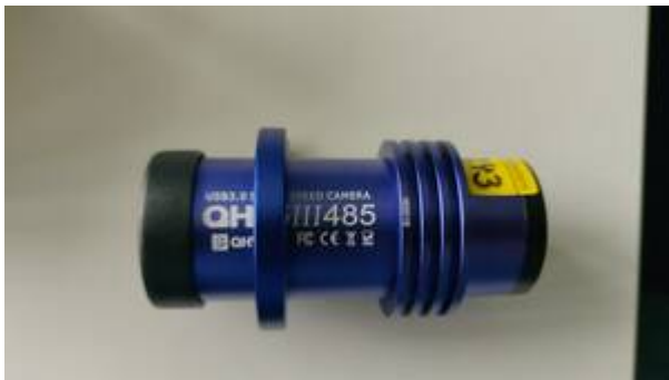
Our QHY 485C