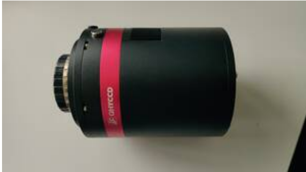
Our QHY 268