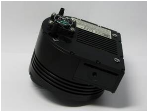
Our SBIG ST-8