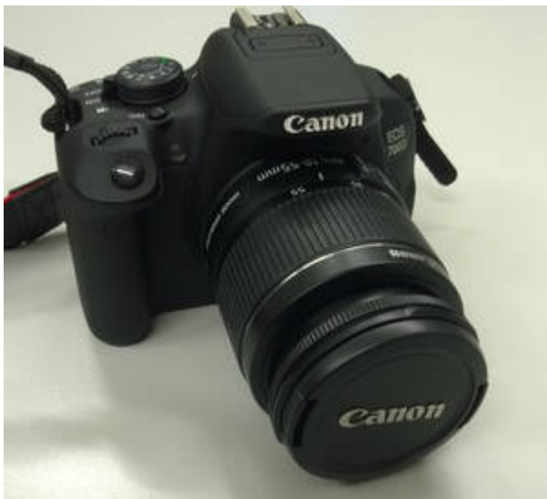
Our DSLR (Canon EOS 700D)