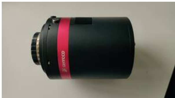
Our QHY 268