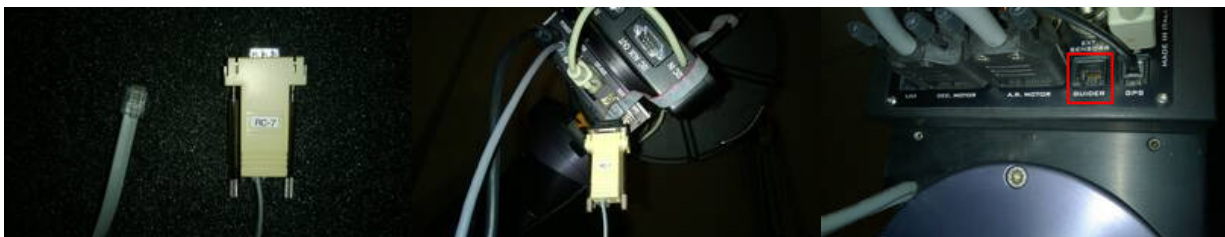
1: Guider cable with the RC-7 plug